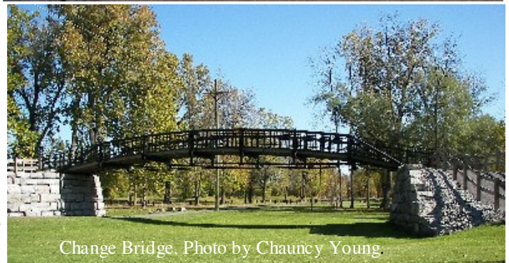
Change Bridge.

Nov. 8– Finger Lakes Trail, Bristol Branch. Six adventurous hikers rode to Ontario County Park on an overcast morning to hike five miles of the Finger Lakes Trail. Some of us have done this hike before in the fall when the leaves are at their peak. By November, most of the color is long gone. We started out following a new trail that was recently laid out by GROC, a local off-road bicycling group. The single track trail winds along the side of the hill through the hardwoods, taking advantage of the terrain. When we caught up with the orange trail on the FLT, we made a wrong turn, heading back to the trail head. Luckily, we ran into a Boy Scout Troop that straightened us around and got us headed for Camp Cutler, our destination. By 1:00 p.m. we reached the top of Cleveland Hill where we stopped at an overlook for our lunch break. By then the overcast had changed to "heavy dew", so the view was not spectacular. From there it was a short romp down the hill to our awaiting 4-wheeled chariot that brought us back to Ontario County Park. We had in mind to stop for a coffee and dessert, but there are not many restaurants open after 2:00 p.m. on a Saturday. We finally found a place in Bloomfield where we warmed up with coffee, carrot cake and pie ala mode.