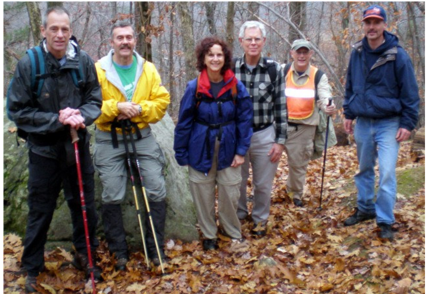
On the Finger Lakes Trail in Camp Cutler.

Nov. 8– Finger Lakes Trail, Bristol Branch. Six adventurous hikers rode to Ontario County Park on an overcast morning to hike five miles of the Finger Lakes Trail. Some of us have done this hike before in the fall when the leaves are at their peak. By November, most of the color is long gone. We started out following a new trail that was recently laid out by GROC, a local off-road bicycling group. The single track trail winds along the side of the hill through the hardwoods, taking advantage of the terrain. When we caught up with the orange trail on the FLT, we made a wrong turn, heading back to the trail head. Luckily, we ran into a Boy Scout Troop that straightened us around and got us headed for Camp Cutler, our destination. By 1:00 p.m. we reached the top of Cleveland Hill where we stopped at an overlook for our lunch break. By then the overcast had changed to "heavy dew", so the view was not spectacular. From there it was a short romp down the hill to our awaiting 4-wheeled chariot that brought us back to Ontario County Park. We had in mind to stop for a coffee and dessert, but there are not many restaurants open after 2:00 p.m. on a Saturday. We finally found a place in Bloomfield where we warmed up with coffee, carrot cake and pie ala mode.