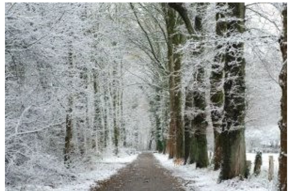
(Continued on page 6)

Before starting a hike, take a moment to see the weather forecast and make a note of the current temperature, the low temperature expected and the time for sunset. The winter days are much shorter, and the hike should not last into the dark without adequate preparation.